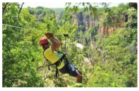
Duration: 2 – 2.5 hours.